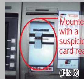
Mounted with a suspicious card reader

3 Culprits install a spy camera behind a bogus bank notice on an ATM to record PIN entries. Members of the public should be aware of any suspicious devices on ATMs.(Pic 4)