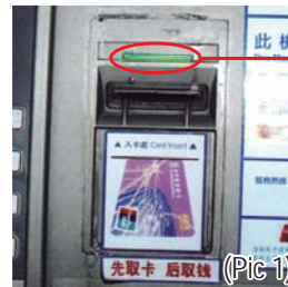
Green flash on card slot

1 Generally a green flash is on above the card slot while it is not so on the fake one.(Pic 1)